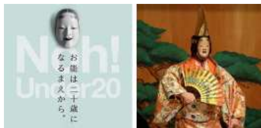
Noh play performed at night by a fire